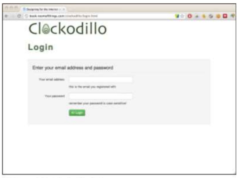
The human-facing Clockodillo login page.