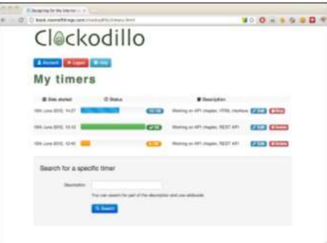
The human-facing list of timers.